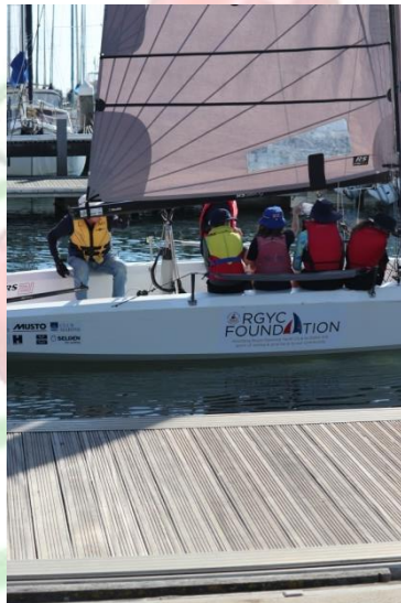
Oberon students enjoying their "Day on the Bay"

We have a number of projects on the go and would appreciate your support with them. Any and all donations are appreciated. The QR codes are provided for your convenience. Donations are tax